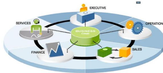
Figure 1-1: SAP Business One provides comprehensive integration

A process gap exists when manual business tasks are not automated, or automation stops in one application and must be manually transferred to another. Process gaps are resolved by duplicate reentry of information from one application into another or by constructing brittle, special-purpose software to do the transfer. Process gaps slow a company down, retard change, and reduce the possibilities for automation. Effective and complete integration in which information flows from one step to the next bridges the process gap, as shown in Figure 1-1.